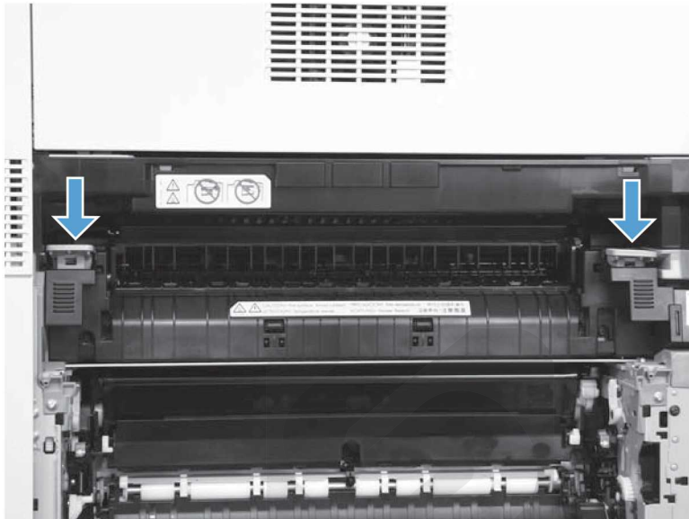
Figure 1-9 Remove the fuser (1 of 2)